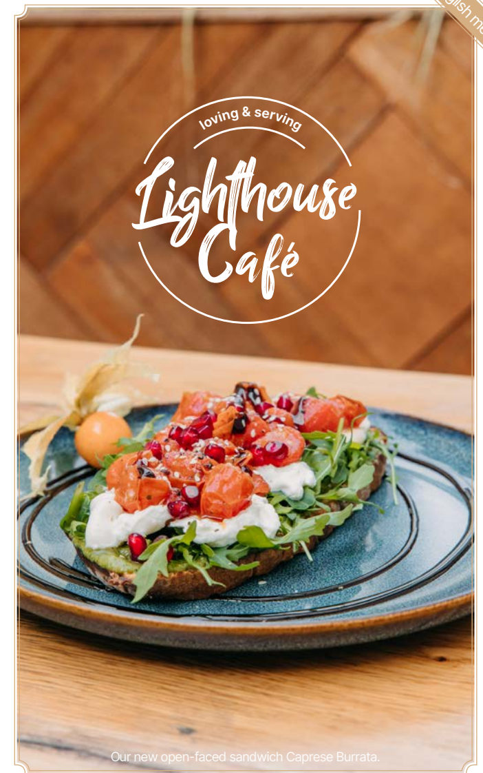
Our new open-faced sandwich Caprese Burrata.

Please place your order at the counter. Thank you!